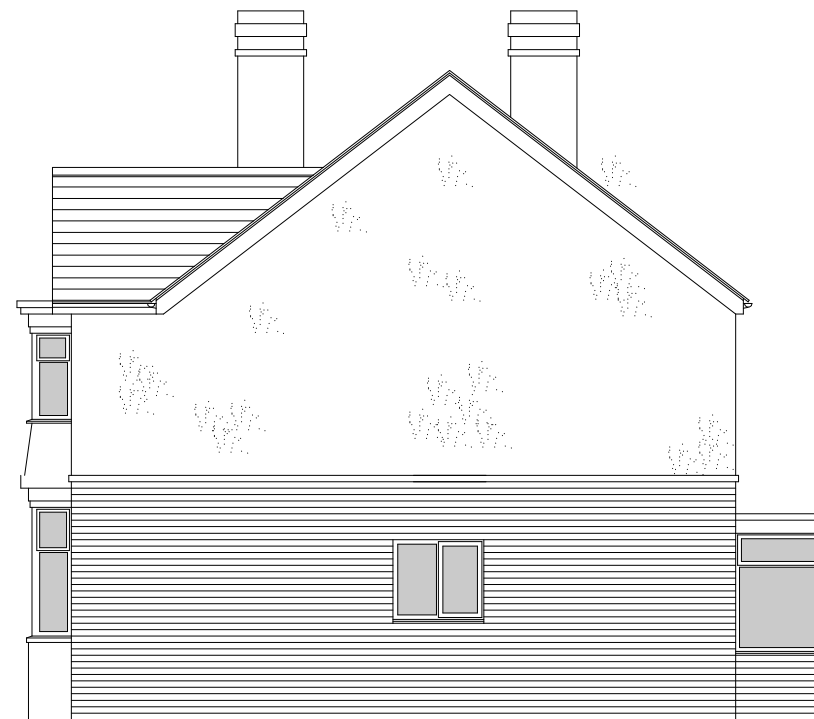
Proposed Side Elevation (scale 1:100@A3)