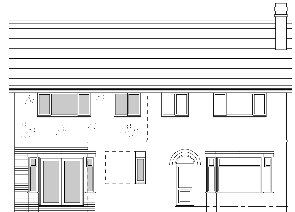
Proposed Rear Elevation (scale 1:100@A3)