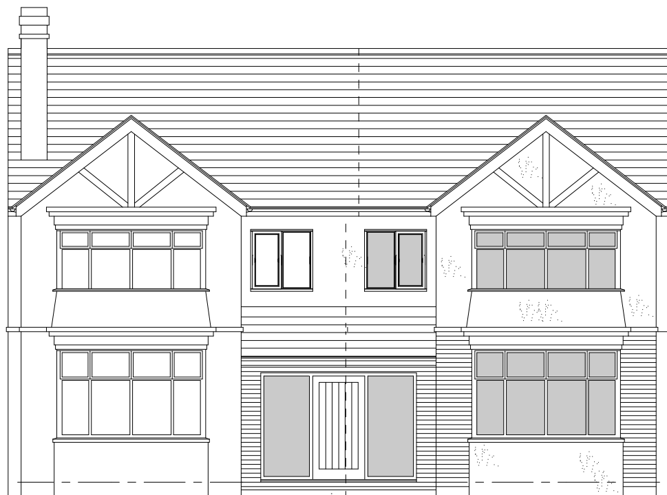
Proposed Front Elevation (scale 1:100@A3)